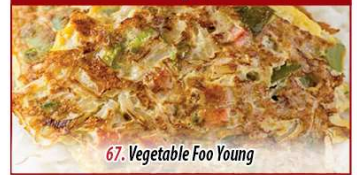
67. Vegetable Foo Young