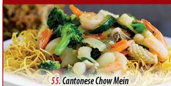
55. Cantonese Chow Mein