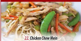
22. Chicken Chow Mein