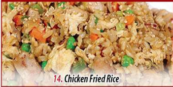
14. Chicken Fried Rice