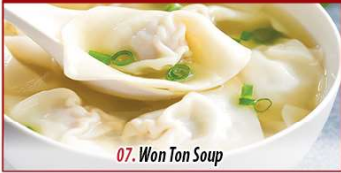
07. Won Ton Soup