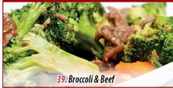
39. Broccoli & Beef