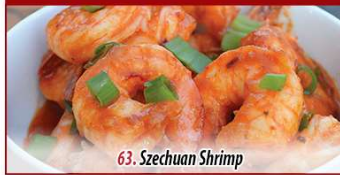
63. Szechuan Shrimp