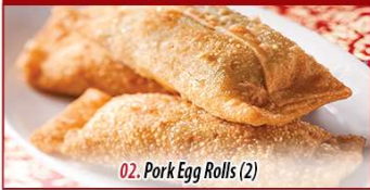
02. Pork Egg Rolls (2)