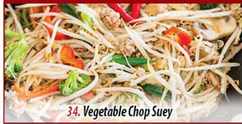
34. Vegetable Chop Suey